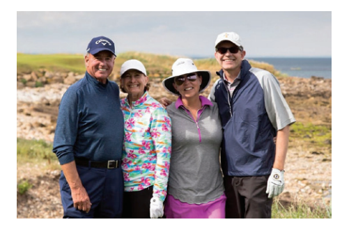
PLAY THE GAME. CRUISE THE WORLD.

888.388.5121 | Expert@PerryGolf.com PerryGolf.com/ Cruise